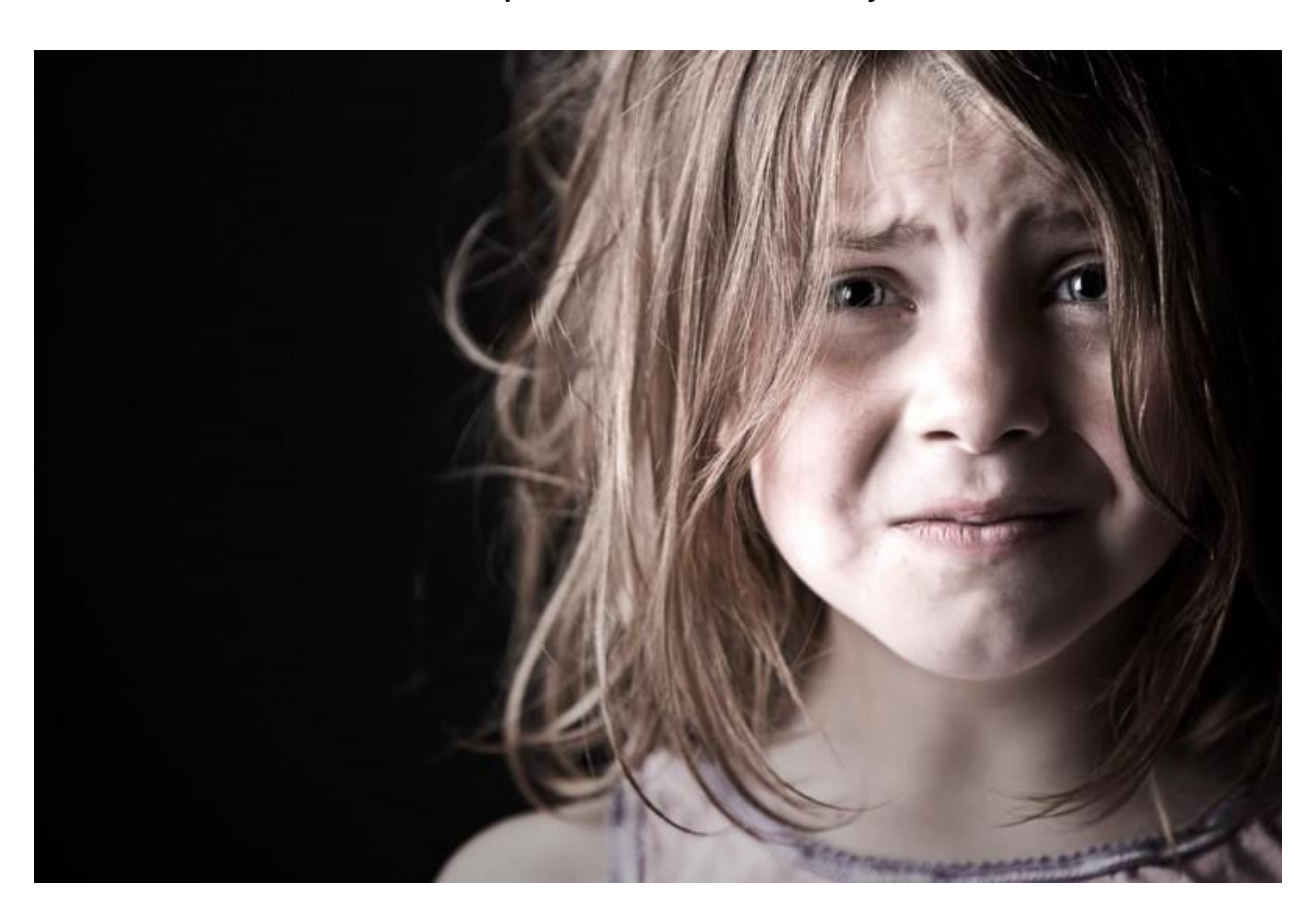
"Mommy and Daddy please calm down."

A five-year-old doesn't know how to handle their parents being a 'hot mess'. Children can't speak up to say, 'could you calm down?' to their parents, so I will say it for them.